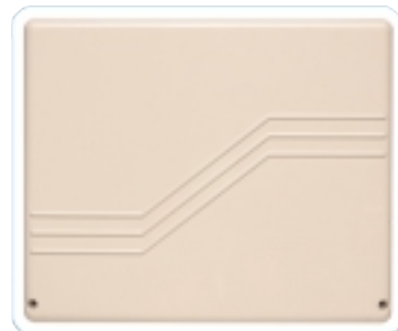
Accord xpC control panel

The Accord xpC downloader is compatible with Windows 95/98, Windows NT, 2000 and XP.